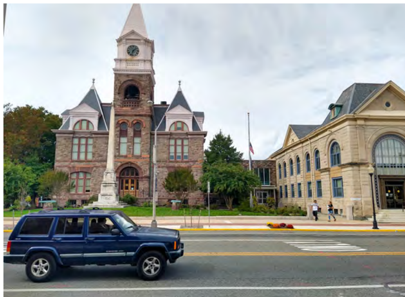
Woodbury, NJ Gloucester County - County Government Seat